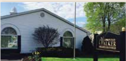
South Portland - Broadway 1024 Broadway South Portland, ME 04106 (207) 773-6511

Our South Portland funeral home, a dedicated space serving our community with care and convenience. Designed as one of the first purpose-built funeral homes in the area, our fully accessible location offers comfort and ease for all visitors.