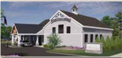
NEW LOCATION Portland - Allen Avenue 300 Allen Avenue, Portland, ME 04103 (207) 773-6511

This 9,899 square foot modern facility aims to redefine funeral home experiences, providing amenities tailored for comfort and convenience: